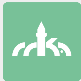
National Department Account