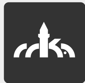
Official National Account